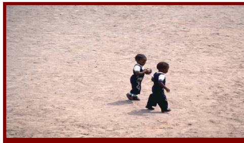
Where do your parents go during training? and why are we in a desert?

and carrying them out. When we have competitions we need parents