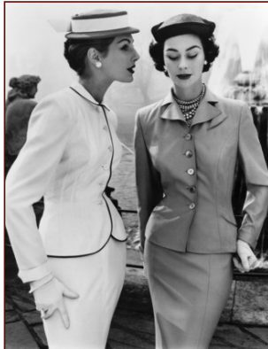
New trampolining clothing slammed as unworkable!

The club has taken huge steps towards bringing back a team uniform. The club is looking to bring back a standardised uniform so that the performers all look the same at competition. The boys Mantard has been chosen and orders will be taken over the next two weeks. The costs have been kept as low as possible whilst having a uniform that makes the performer stand out from the crowd. The cost of the