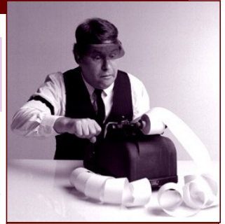
Number crunchers have told the City of Salford to get on the ball

should keep a surplus of at least £30 in their account at all times so that they allow for any mistakes. The Spokesman for the club went on to say that they will be exempt from this rule whether one of the top 10 faced regional G performer all will be held to this rule without exception". The spokesman for the club went on to make it clear that if anyone has any queries on their accounts they should put the query in writing a letter or email to the committee so they can have someone look in to it as soon as possible so issues can be resolved quickly.