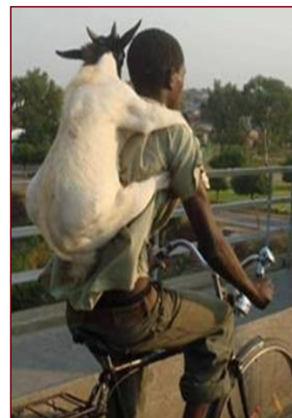
Men traveling from far and wide to join the national goat herding championships, this man is taking his goats one at a time from Devon to Birmingham.