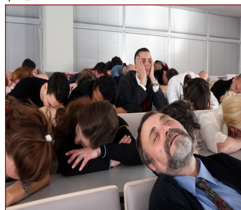
After drinking and eating all the tea, coffee and biscuits the parent reluctantly return to the meeting for a nap!

the club is desperate to restart, things like bag packs, displays and general money donations. The club is always in search of new ways to advertise the club whilst making money to pay bills, buy equipment and even send people on training courses. Not all these things we can get through grants so they are very important", said a club spokesman. With all said and done the club seems to be on the up and with the parents backing the only way is up.